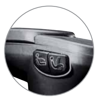
Most Adjustments are made while seated by activating button controls built into the armrests.